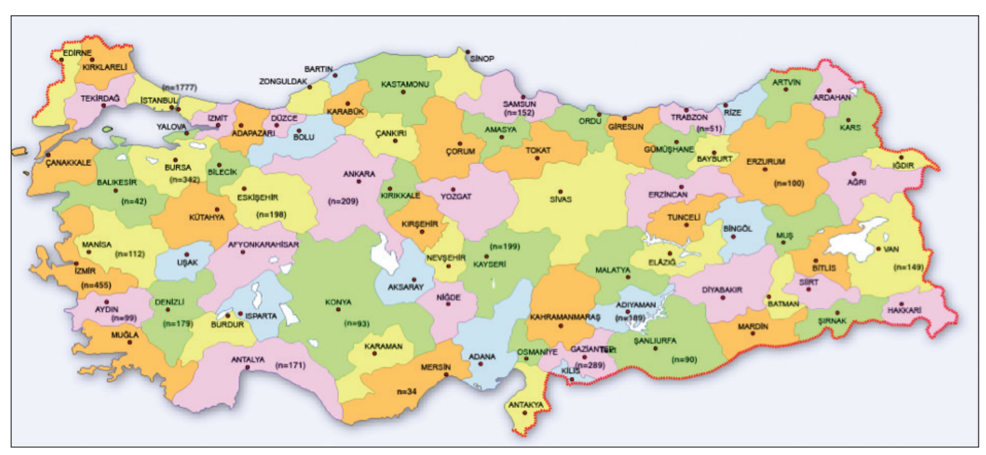
Figure 1. Number of healthcare professionals participating by provinces.