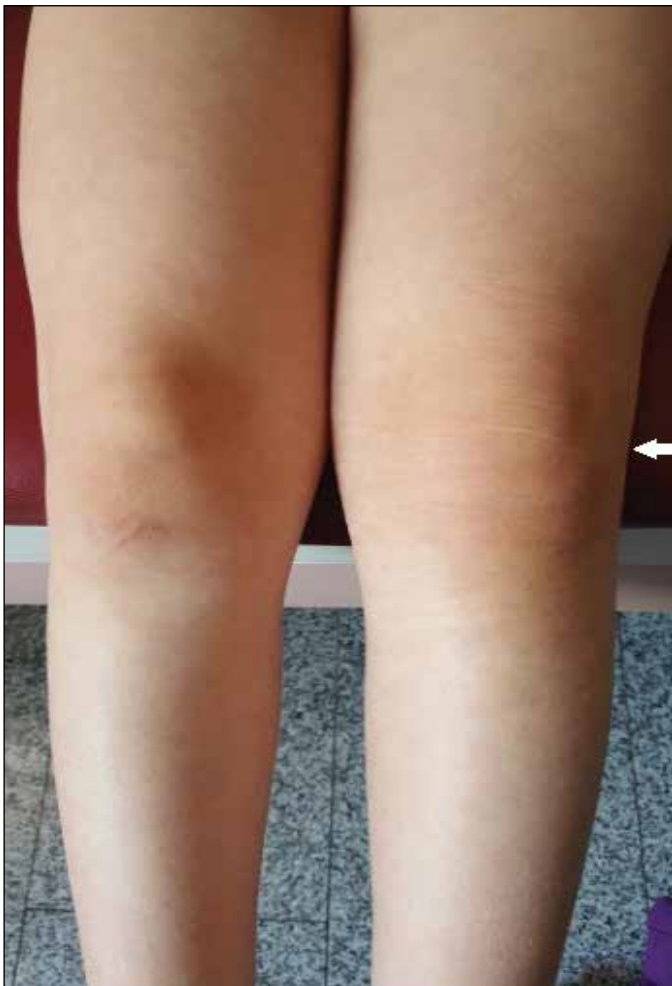
Figure 1. Left knee swelling (white arrow) at admission.

temperature of 39°C, a heart rate of 115 beats/minute, a respiratory rate of 22 breaths/minute, and a blood pressure of 115/80 mmHg. His left knee was swollen, warm to touch, and extremely tender upon palpation, with limited flexion and extension, owing to pain (Figure 1). There were no abnormalities in his other joints, eyes, skin, and genitourinary system.