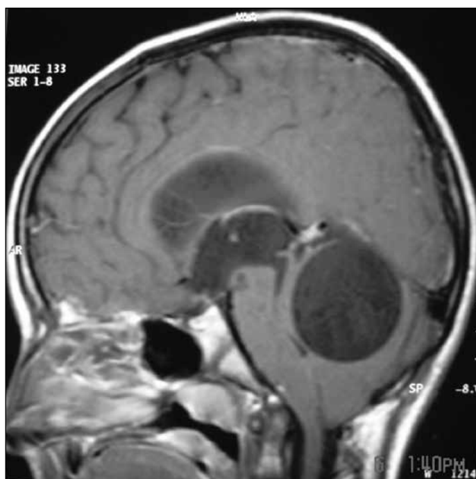
Figure 4. Cranial MRI revealed a midline cerebellar cystic lesion of 4 x 4 cm, which was hypointense on T1-weighted images.

found in patients 2 and 4. However, because our country is an endemic region, all the children in our series may have been infected by eating ingested food or milk.