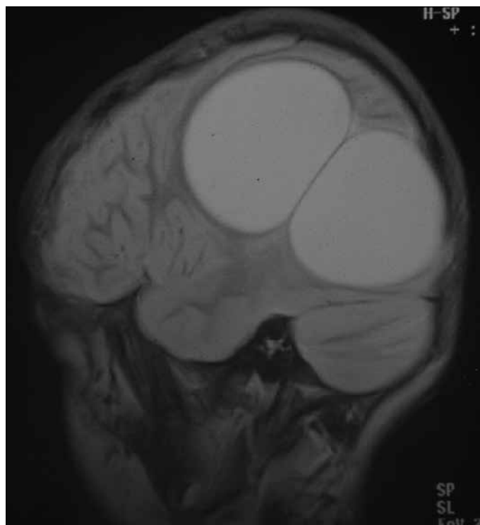
Figure 1. T1-weighted image of a multiloculated cyst in the left fronto-temporal region.

A 14-year-old boy was admitted to our emergency department in a state of deep stupor. He was suffering from headache, vomiting, malaise and intellectual deterioration lasting for 15 days. The day before hospitalization he had three seizures lasting for about 5 minutes each. He had a history of